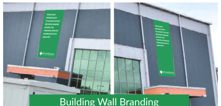
Building Wall Branding