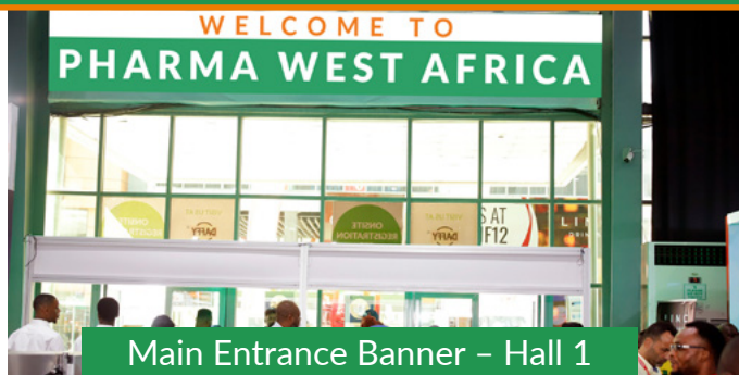
Main Entrance Banner – Hall 1