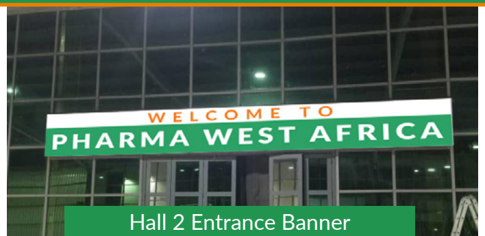
Hall 2 Entrance Banner