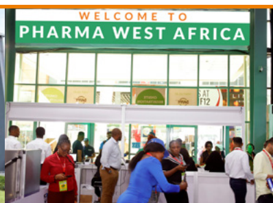
Main Entrance Banner – Hall 1