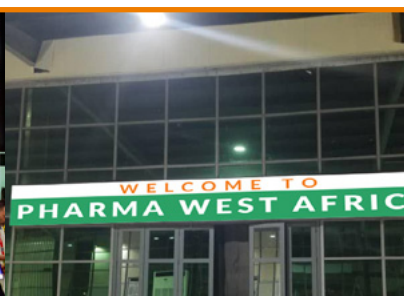
Hall 2 Entrance Banner