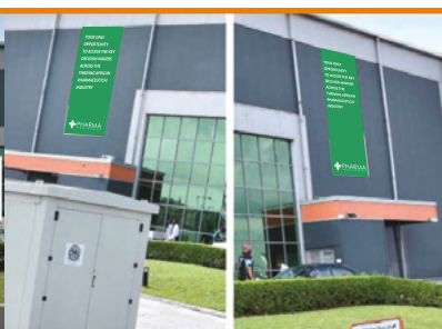
Building Wall Branding